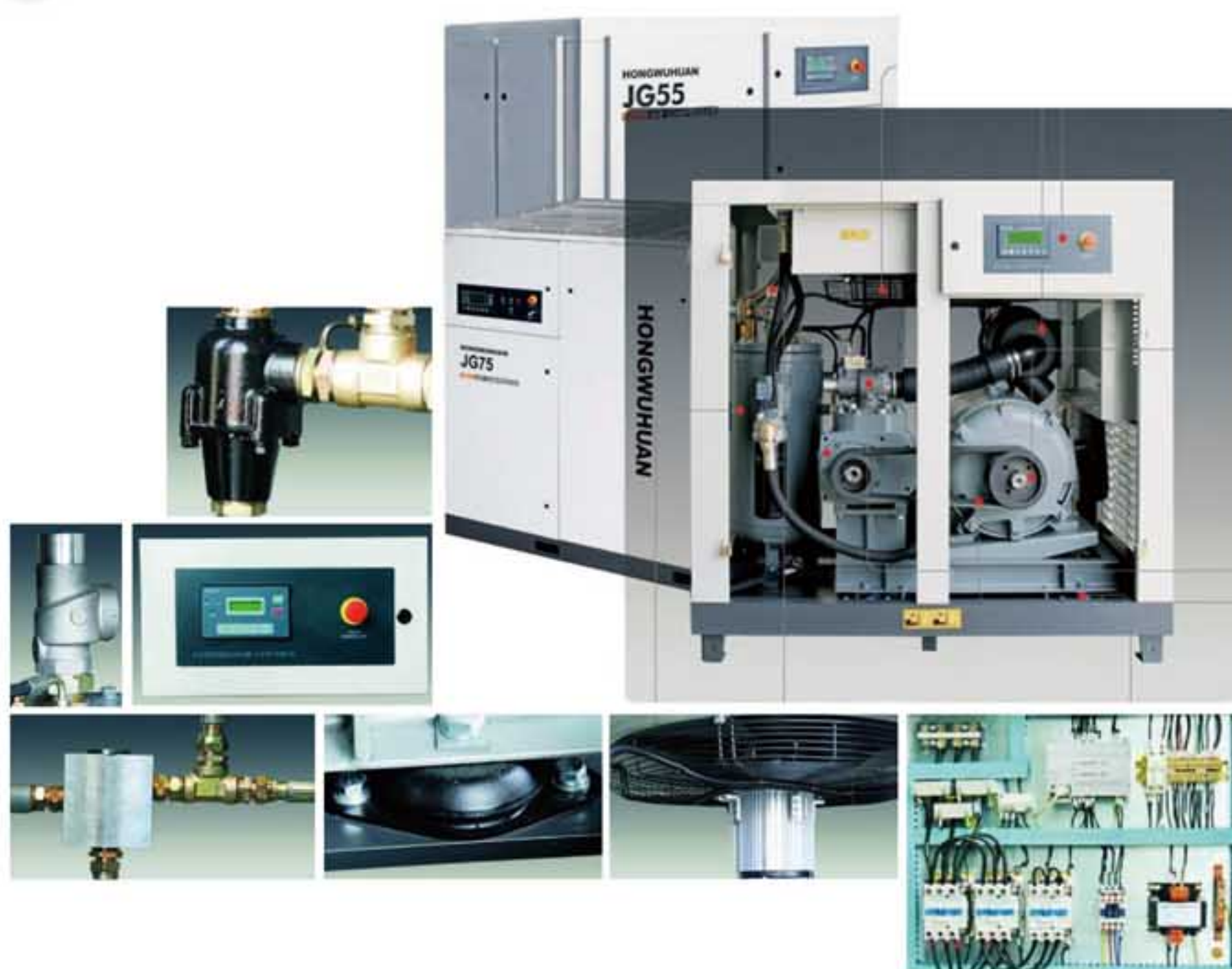
The Specification For Screw compressor (Belt)