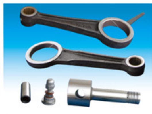
High-quality components engineered with 32 years of experience

PET-All PETStar has the technology and the ability to design a compressed air system suited specifically to your application.