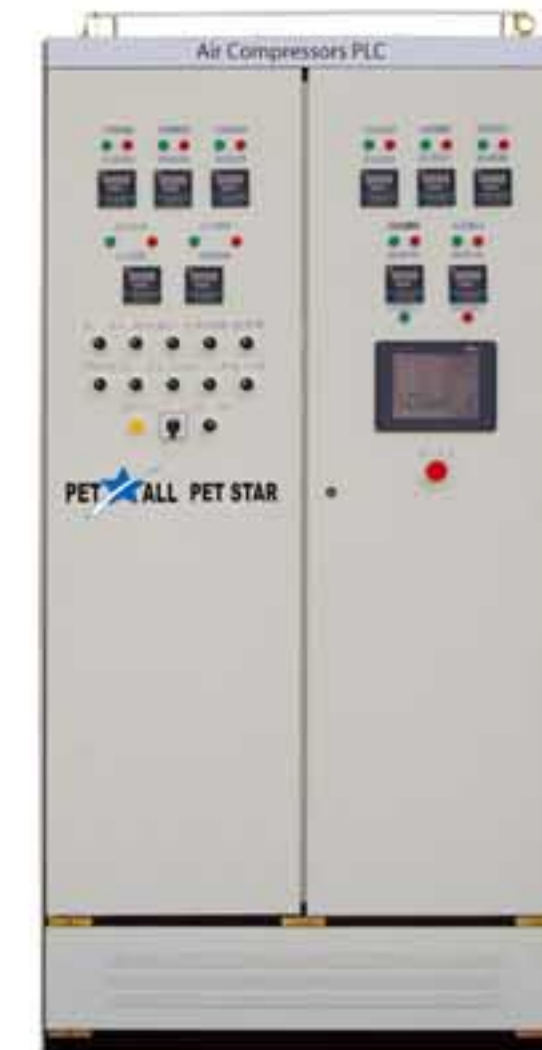
PROGRAMMABLE LOGIC CONTROLLER